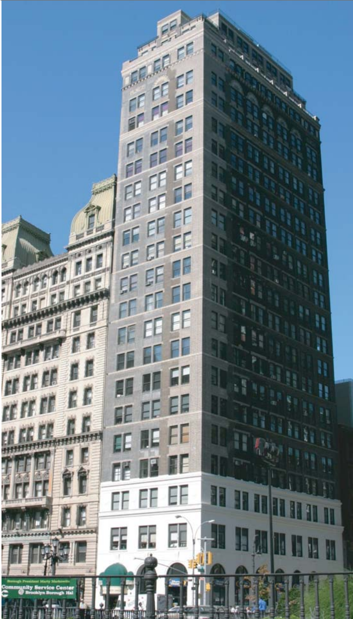
10th Floor Suite - 5,400 SF (approx)