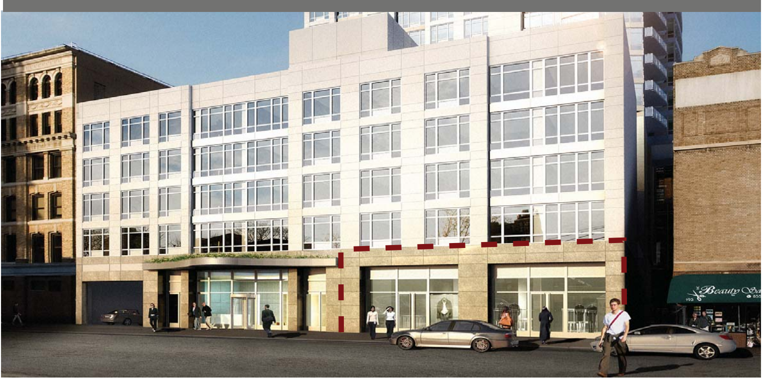
Schermerhorn Street Entrance