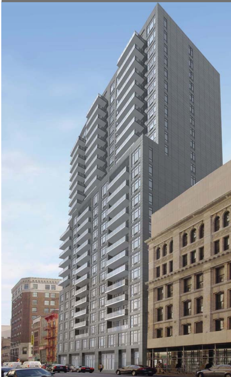
Livingston Street Entrance